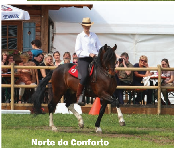
Norte do Conforto