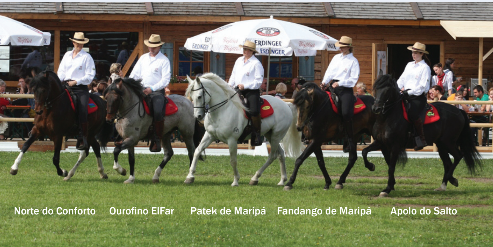
Norte do Conforto Ourofino ElFar Patek de Maripá Fandango de Maripá Apolo do Salto