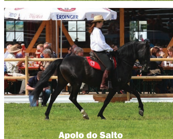
Apolo do Salto

Fandango de Maripá was in the big show for the first time as he took Urano de Maripá's place. He is only 5 years old and made an excellent job. He was calm and relaxed.