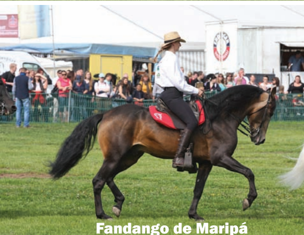
Fandango de Maripá

Fandango de Maripá was in the big show for the first time as he took Urano de Maripá's place. He is only 5 years old and made an excellent job. He was calm and relaxed.