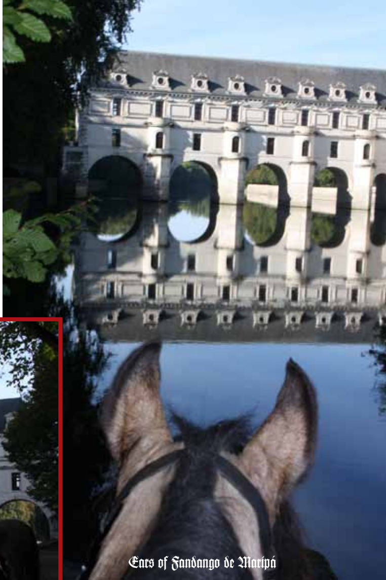
Ears of Sandango de Maripá

Next morning after breakfast pack up and leave the Prieuré de la Chaise, rejoin the horses and ride to the magnificent château de Chenonceau followed by a visit of this jewel of the Renaissance. Lunch at one of the restaurants of the Château. The afternoon was spent riding through the beautiful forest of “Amboise” until Souvigny de Touraine. Here the horses spent the night in the „Gite Equestre Le Tremblay“ in nearby Vallieres Les Grandes (5km). A ten-minute car transfer brought the riders to the majestic Château de Pray overlooking the Loire river.