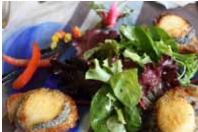
fromage de chèvre