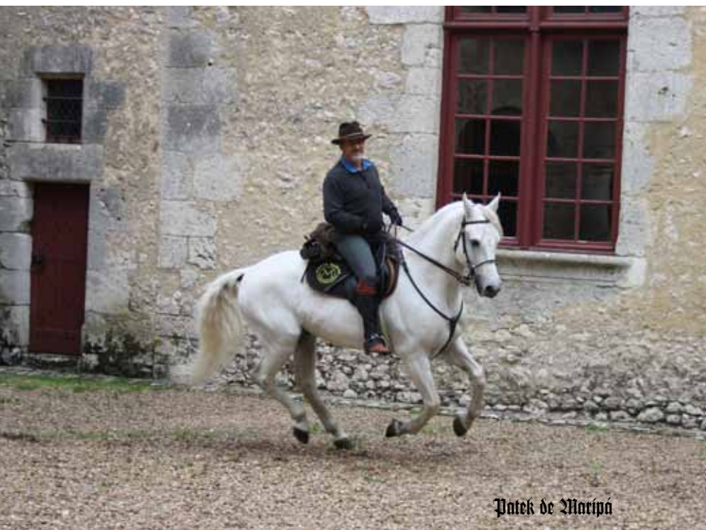
Patek de Maripá