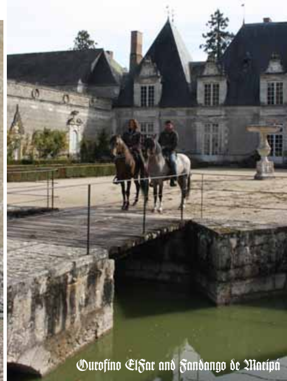
Durofino ElSar and Sandango de Maripá