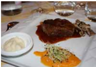
Filet de boef