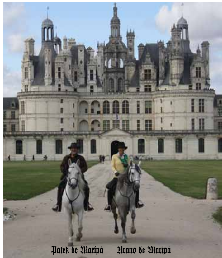
Patek de Maripá