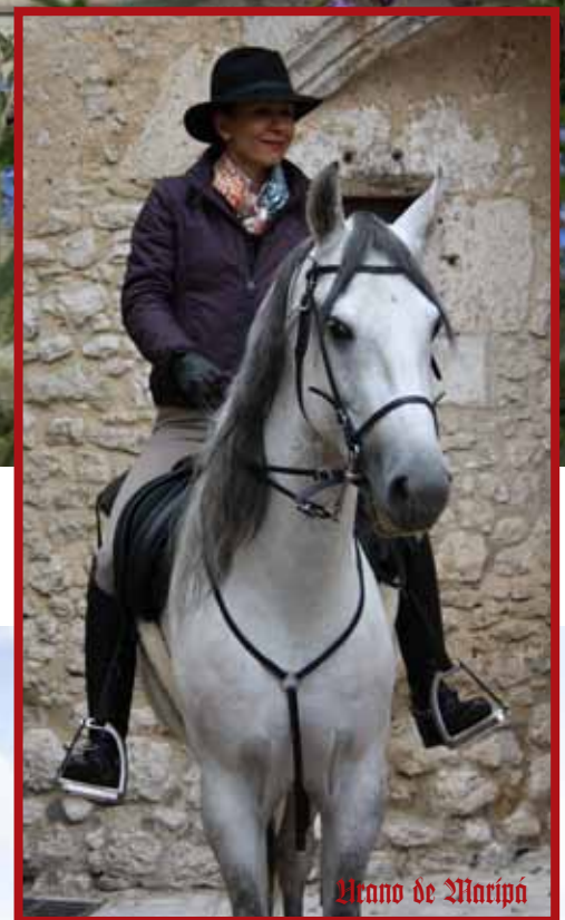
Meano de Maripá

Next day we rode over hill and dale to the small fortified castle of Fougères sur Bievre where we stopped for lunch. We then continued on to the Château du Breuil leaving our horses at the „Ecuries de la Fouasserie“ in Cormeray.