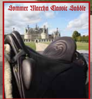
Urano de Maripá