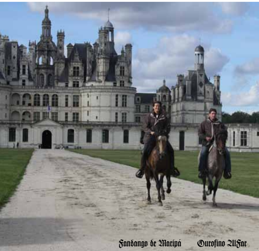
Sandango de Maripá