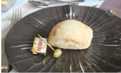
Pain et beurre