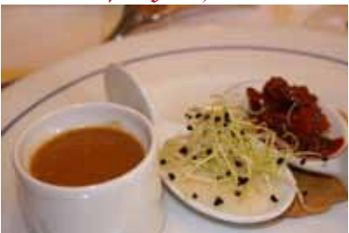
Soup de hommarde