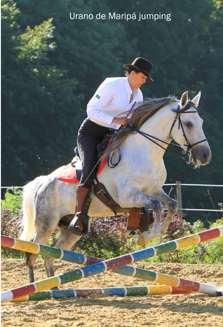
Urano de Maripá jumping

Patek de Maripá even won the dressage contest!