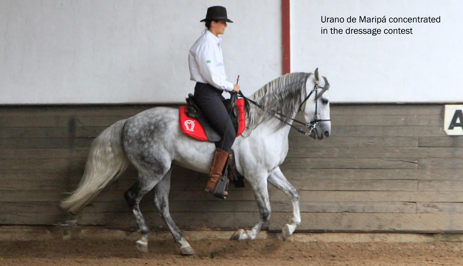
Urano de Maripá concentrated in the dressage contest

Most horses participating in these contests have been Lusitanos and PREs. It was the first time that Mangalarga Marchadores have been shown in this riding scene in Europe. They all did very well and